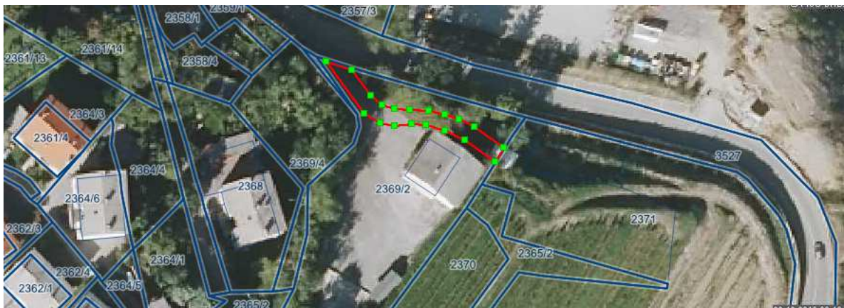
Prikaz 2 (kataster in foto – povečava)